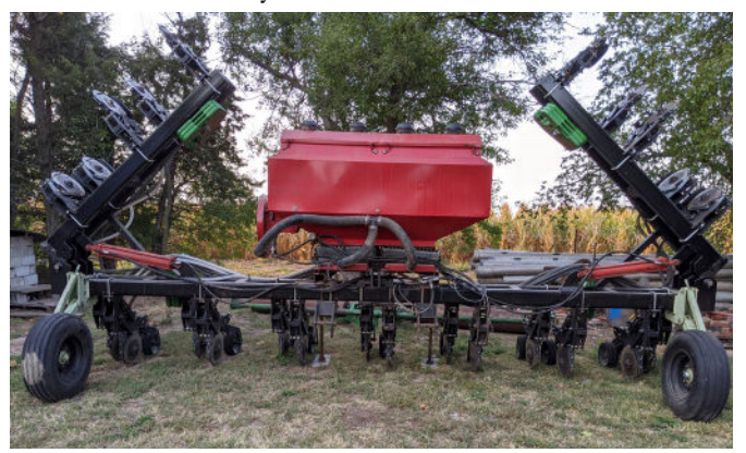
Figure 10. A row-unit based custom made interseeder equipped with an air delivery seed box.

Interseeders, as seen in Figure 10, are almost always fully mounted to the tractor for following rows, and the weight of the unit must be kept down to maintain tractor stability. Organic operations can combine this type of seeding with a mechanical weed control pass, capturing additional efficiency.