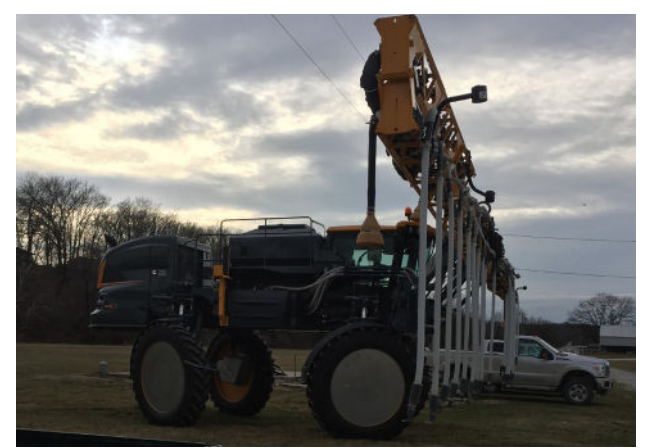
Figure 8. A modified sprayer outfitted with a air delivery seeding system on the boom.

Like the seed delivery system on a VT attachment or air boom spreader, high-capacity blowers and metering systems are required for the sprayer boom's width and fast ground speed. The labor required to swap the sprayer to the seeding equipment and back can be an obstacle to this type of seeding. Kits can be purchased to convert specific models of sprayers to seed cover crops but can be more expensive than estimated costs of custom-built units.