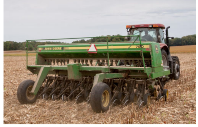
Figure 3. A no-till box-type drill is a good solution for uniform emergence at a low cost.

Box drills are simpler and less expensive than either planters or air drills. Some end-wheel style box drills do not provide any downforce beyond the weight of the row units — insufficient for many no-till conditions. No-till box drills, as shown in Figure 3, use the weight of the box, frame, and seed payload to hold the row units in the ground, enabling good seeding in tight soil or high residue scenarios. No-till box drills are, in many situations, well suited for cover cropping goals.