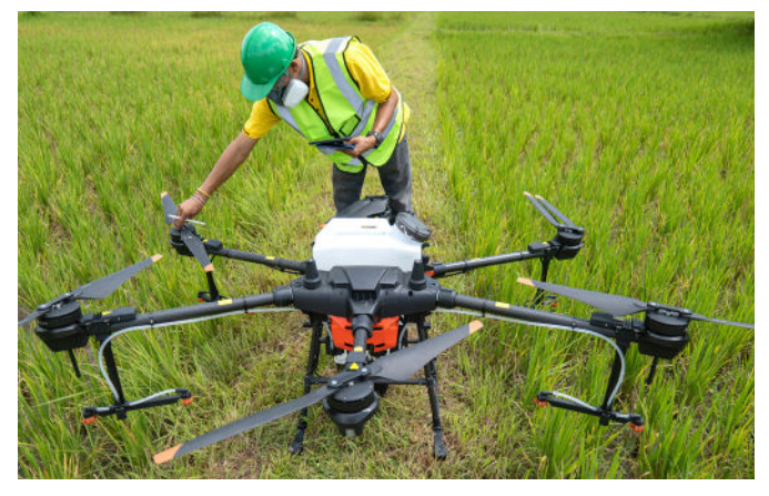
Figure 11. Large agricultural drones fitted with seeder attachments can broadcast cover crops in-season without crop damage in confined fields.

For large, open fields, airplanes operated by custom applicators can be a fast, efficient way to seed many acres. Smaller, tree-lined fields are less suitable for airplane seeding. Both drones and helicopters are better suited for smaller fields but may work at a slower rate and cost more per acre. Some farms may be able to purchase their own drones, allowing an extra degree of freedom in application timing and strategy. The uniformity of seed spread and seed-soil contact is similar to that of a high clearance spinner spreader.