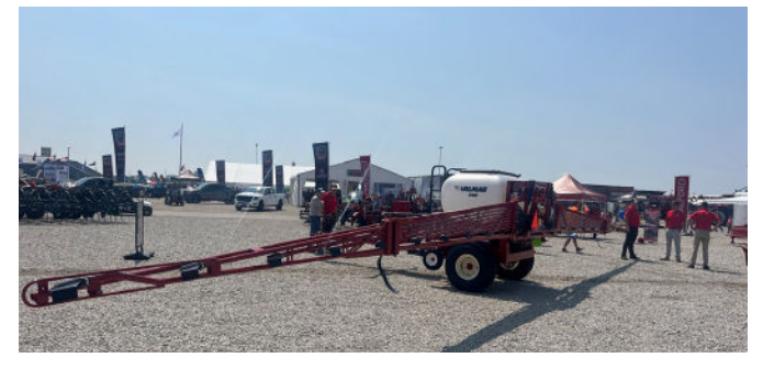
Figure 5. An air boom spreader can be a quick and effective way to seed a variety cover crops.

replaces the spinner apparatus with a blower and boom system that spreads seed evenly across the entire width of the machine. Additionally, seed mixes and small-seeded crops can be handled with ease using an air boom. Wind has less impact on the spread pattern of an air boom spreader. Air boom spreaders retain the rapid coverage rate of spinner spreaders and the ability to merge seeding with fertilizer application but are more costly to own and maintain. A small air boom spreader suitable for seeding cover crops on many farms is shown in figure 5.