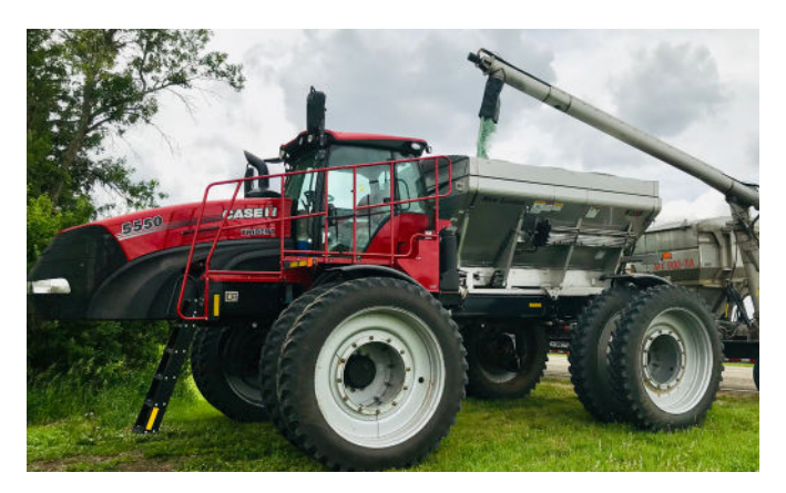
Figure 9. High clearance spreaders can straddle crop rows to spread seed and fertilizer over growing crops.

season applications may be challenges for high clearance spreaders. High clearance spinner spreaders and air boom type spreaders are both available. Figure 9 shows a spinner-style high clearance spreader.