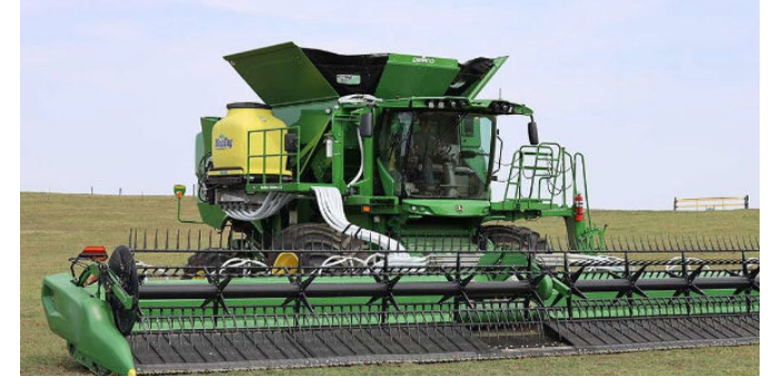
Figure 7. A air seeding box and tubing system mounted on a combine can seed cover crops at the same time as harvest.

Like a VT cover crop attachment, combine attachments usually include a seed box, blower and tubing system that runs seed to the header or straw spreaders. The advantages and disadvantages of spinner spreaders or air boom spreaders apply to combine-mounted cover crop seeders. An example of a combine-mounted seeder is shown in Figure 7.