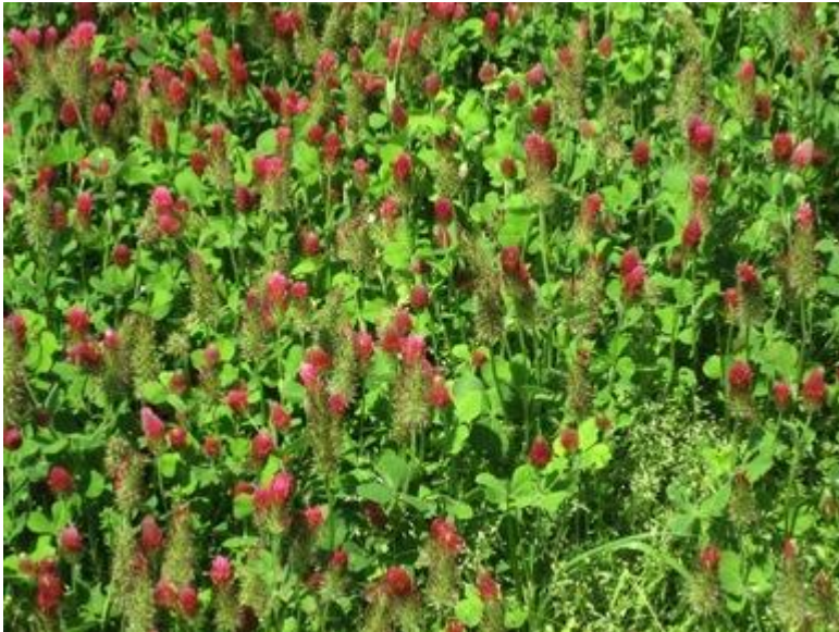
Crimson clover in a Missouri field.