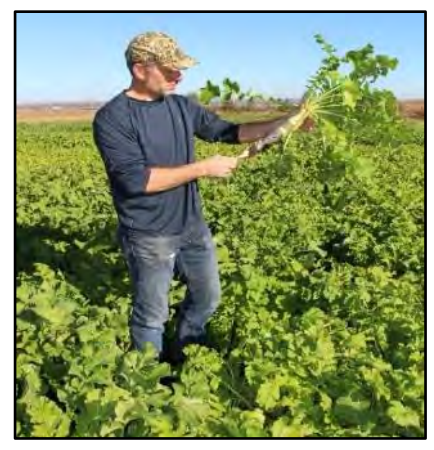
Daikon radish taproot

Benefits: N scavenger, improves organic matter and soil structure, erosion control, weed suppressor, livestock forage.