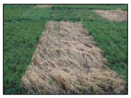
Merced (center) and FL 401 (upper right) had poor winter survival for both years in Kansas, Michigan and Missouri.

Expected Adaptation : Most cereal rye varieties exhibited good to excellent fall cover, low disease and insect problems and excellent winter survival except for FL 401 and Merced, which overwintered poorly at all locations both years. For producers seeking a cereal rye variety that produces a quick fall cover with acceptable fall stands that may not require chemical or mechanical termination in the spring, Merced or FL 401 may be good choices for incorporating into a cropping system.