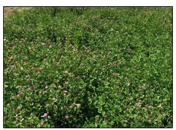
Late spring growth of Mammoth red clover in Missouri.

varieties generally had good quick fall cover in East Lansing, MI and fair to poor in Manhattan, KS and Elsberry, MO. Fall stand quality of the varieties was only acceptable in East Lansing, MI. Overall winter survival was excellent to good among varieties, but they winterkilled in Manhattan, KS in 2017-2018. All varieties were similar in maturity (50% bloom) but varied across locations. Insect and disease damage was none or low.