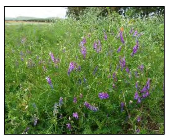
Hairy vetch flowers

Benefits: N source, weed suppressor, improves organic matter and soil structure, pollinator habitat.