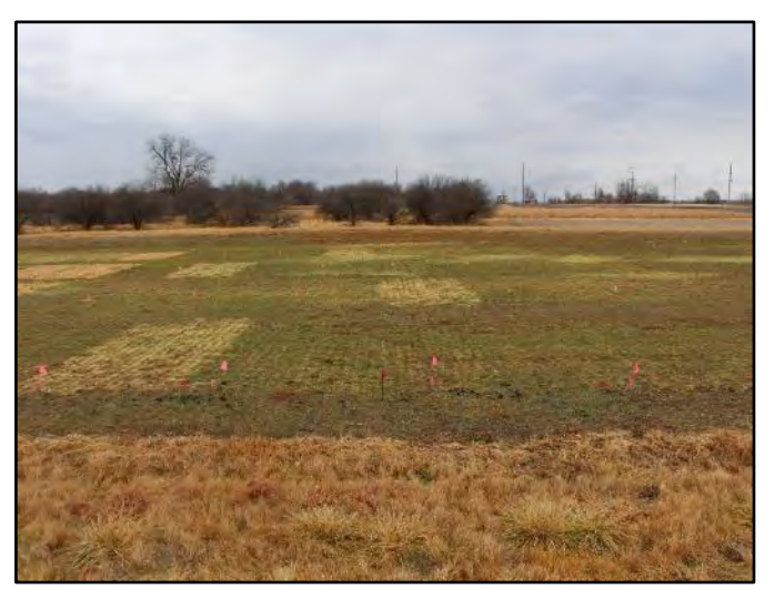
Early winter growth of hairy vetch varieties in Elsberry.

Expected Adaptation: Hairy vetch varieties provided good, quick fall cover in East Lansing, MI and Elsberry, MO and fair fall cover in Manhattan, KS. All varieties provided acceptable fall stand quality except Lana in Manhattan, KS in 2016. Winter survival was good to excellent for all varieties across locations and years. Varieties were similar in days after planting to maturity (50% bloom) and varied across locations. None to low insect or disease damage was observed on any variety.