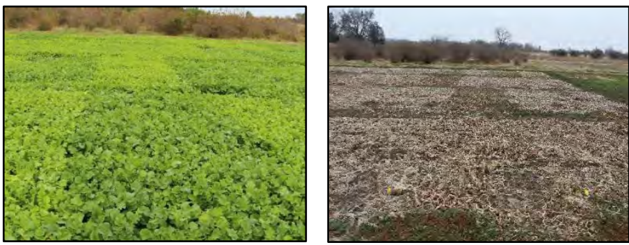
Daikon radish varieties provided quick fall cover in Kansas, Michigan and Missouri but did not survive the winters.

Expected Adaptation : Daikon radish varieties exhibited excellent to good, quick fall cover and acceptable fall stand quality except Graza in Manhattan, KS both years and Elsberry, MO in 2016. None of the varieties survived the winters in Manhattan, KS, East Lansing, MI, Elsberry, MO. Daikon radishes are ideal for producers needing a cover crop that provides early fall cover that does not require chemical or mechanical termination.