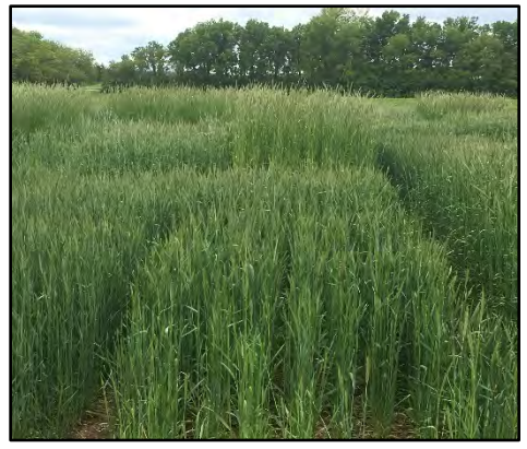
Cereal rye varieties at the Manhattan, KS Plant Materials Center.

Benefits: N scavenger, improves organic matter and soil structure, erosion control, weed suppressor, livestock forage.