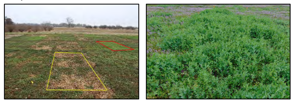
Arvica 4010 (yellow) had poor winter survival in Missouri both years. Survivor 15 (red) had the highest winter survival in Kansas and Missouri. Early spring growth of Survivor 15.

Expected Adaptation : Field pea varieties had good to excellent quick fall cover and acceptable fall stand quality across locations and years, except for Windham in Manhattan, KS in 2017. All varieties winterkilled in East Lansing, MI and varied in survival at other locations and years. Days after planting to maturity varied among surviving varieties in Manhattan, KS and Elsberry, MO. Disease damage was greatest on surviving plants in Manhattan, KS. Insect damage was low on surviving plants in Manhattan, KS and Elsberry, MO.