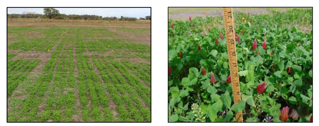
Late fall growth of crimson clover plots in Elsberry, MO (left). AU Sunrise blooming in Mid-April in Elsberry, MO (right).

Expected Adaptation : Most crimson clover varieties had good, quick fall and acceptable fall stand quality in Elsberry, MO and East Lansing, MI. Winter survival varied among varieties across locations and years but was generally good to excellent. Days to maturity (50% bloom) were similar among varieties across locations. Disease and insect problems were low to none.