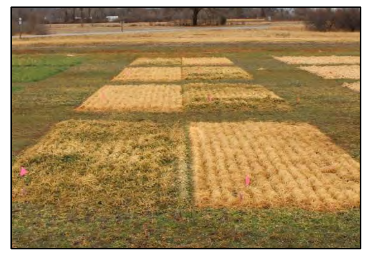
Soil Saver and Cosaque provided quick fall cover and adequate stand quality but Soil Saver winterkilled in Kansas, Michigan and Missouri.

Expected Adaptation : Soil Saver (black oats) and Cosaque (black seeded oat) rated good for quick fall cover and acceptable stand quality across locations and years. Soil Saver winterkilled at all locations. Cosaque had good winter survival at all locations in 2016-2017 and low to marginal winter survival in Elsberry, MO and Manhattan, KS in 2017-2018. Surviving plants were highly susceptible to foliar diseases in Manhattan, KS. Soil Saver may be a good choice for producers needing a quick growing cover crop requiring no chemical or mechanical termination prior to planting cash crops in the spring.