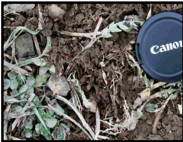
Honey-combed soil and coated red clover seed (pink) the day after frost-seeding.

Frost-seeding is the practice of overseeding forage or cover crop seed in late winter for the purpose of adding new species components to grasslands or row crops, or renovating existing grasslands. It is an inexpensive and effective method for improving productivity and forage quality of grasslands without having to completely start over, and has the advantage of keeping pastures and hayfields in productive use throughout the improvement process. Because establishment is often uneven with this method, frost-seeding is not recommended for primary establishment of new fields.