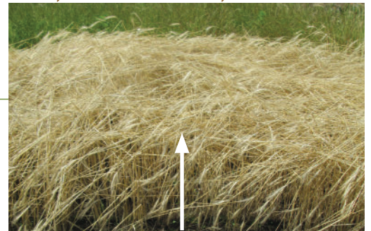
Winter rye three weeks after mid-May termination.

*Visual assessment determined 100% termination after 3 weeks.