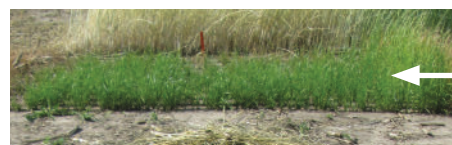
Annual ryegrass regrowth two weeks after mid-May termination.