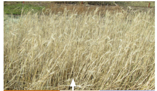
Winter rye two weeks after termination with glyphosate.