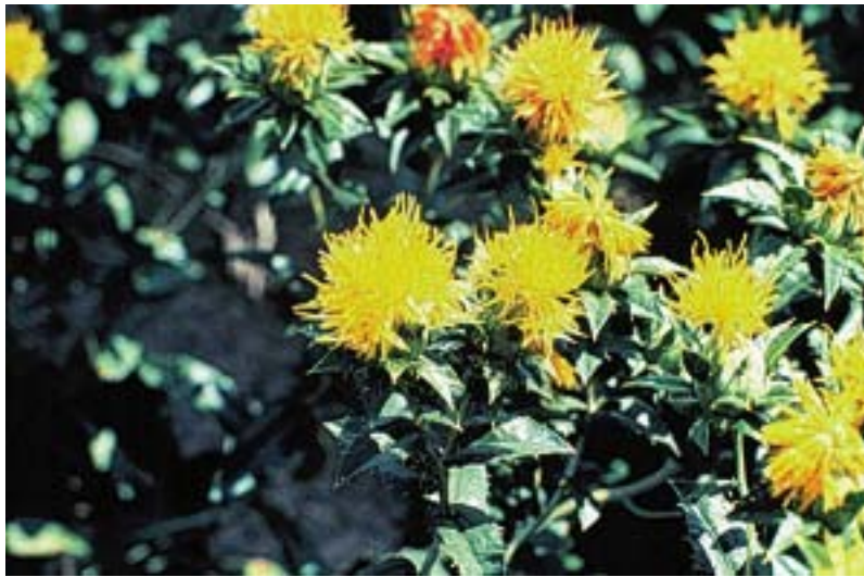
Figure 3. Safflower plants in bloom.