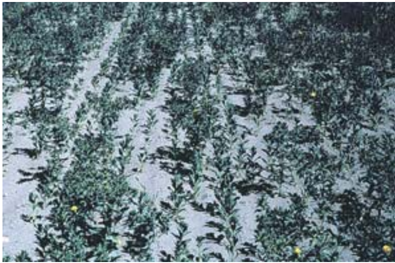
Figure 2. Soil crusting can severely affect stand establishment. Conditions favoring soil crusting also favor Pythium and Rhizoctonia seedling blights.

In South Dakota, the best locations for growing safflower are in the western half of the state. This is primarily due to the generally lower humidity in that area of the state during sensitive stages of plant growth. High humidity and long dew periods, such as those commonly present in the eastern tier of counties in South Dakota, favors significant infection by leaf diseases. Wider rows will allow greater air movement between plants as the plants grow, which may reduce humidity in the plant canopy and reduce the potential problems with disease. Safflower, however, is a poor competitor with weeds, and close rows generally create a more competitive stand of the established crop. Postemergence herbicides are not currently available for this crop, so there is a heavy reliance on preemergence products and crop competition to reduce weed pressure.