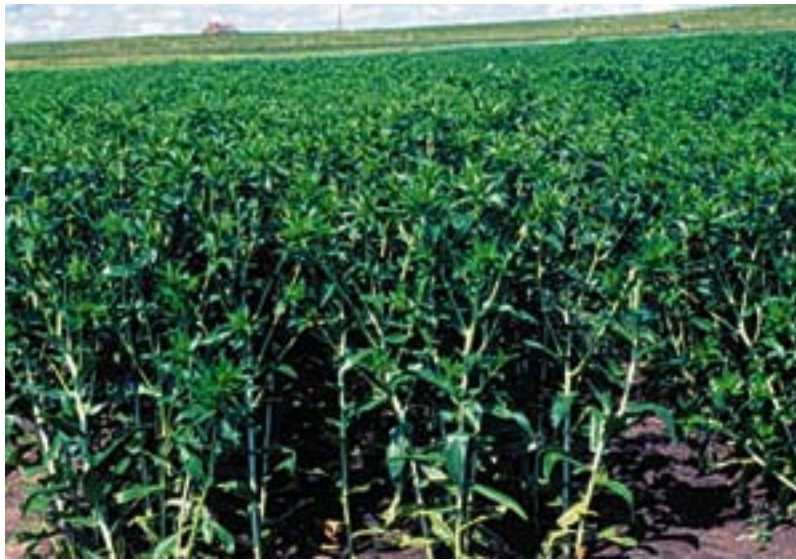
Figure 1. Healthy safflower plants grow to 15-30 inches in height.