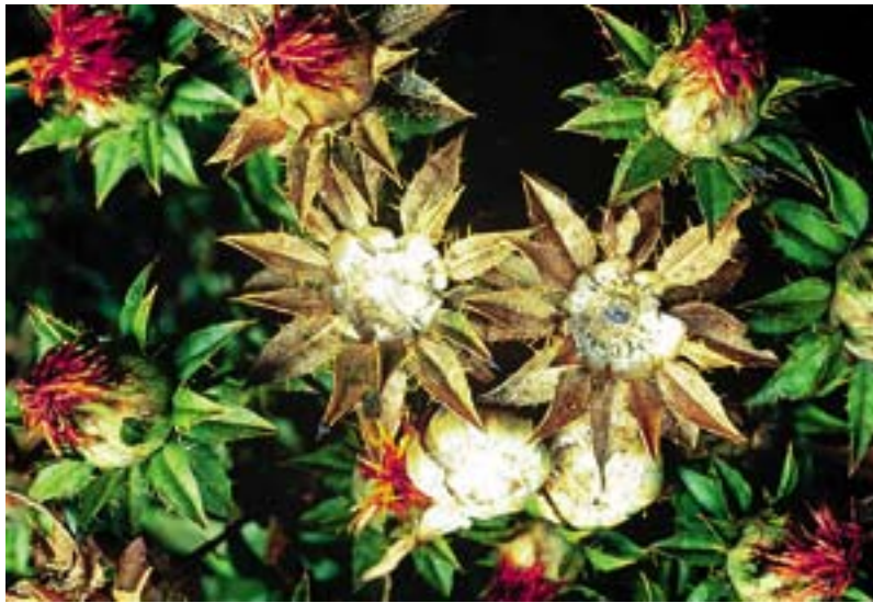
Figure 8. Safflower heads showing severe damage from Sclerotinia .