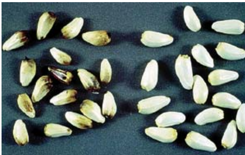
Figure 10. Safflower seeds discolored by Alternaria (left) and undamaged seed (right).