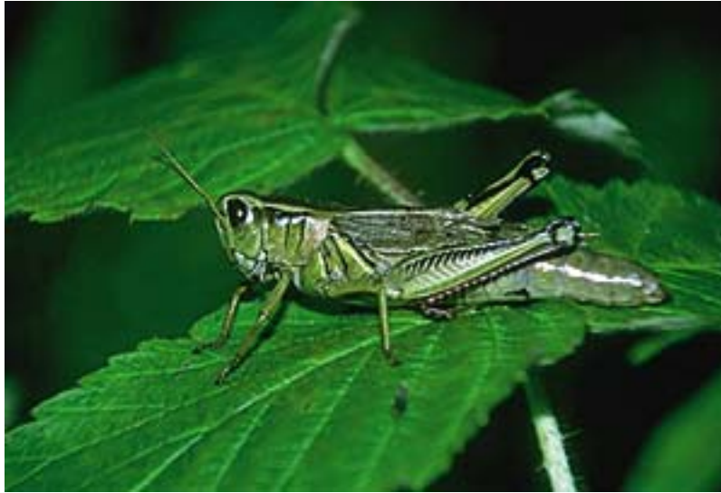
Figure 6. Grasshoppers may be a concern in South Dakota in any year if environmental conditions are favorable.