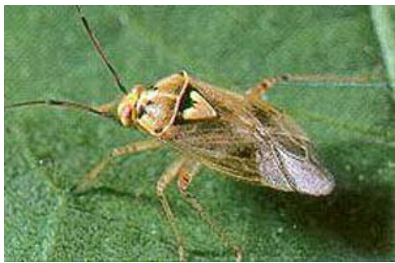
Figure 7. Lygus bugs can cause blasting of heads if feeding is severe.