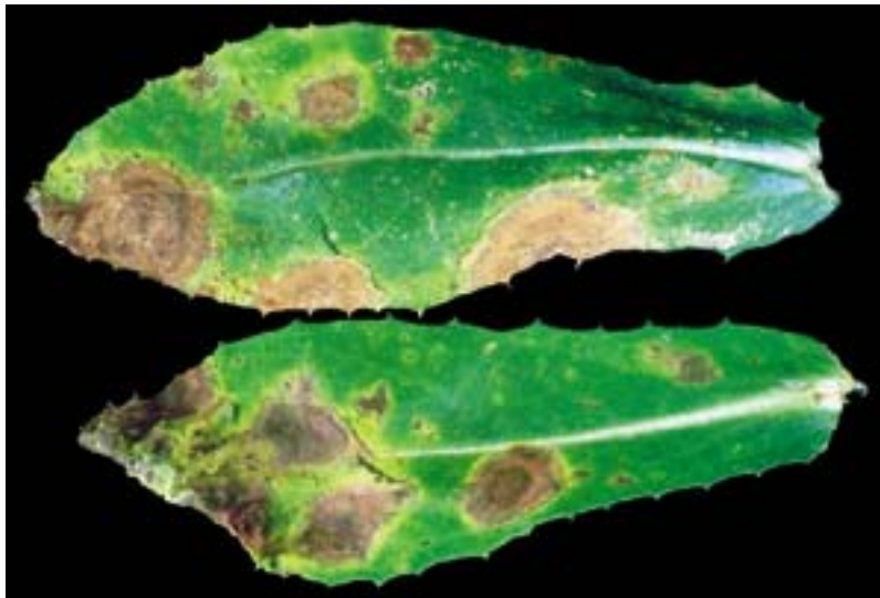
Figure 9. Leaves damaged after infection by Alternaria . Note the concentric rings shown on the lower leaf.