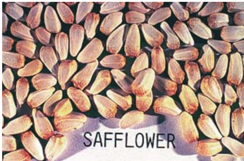
Figure 5. Safflower seed.