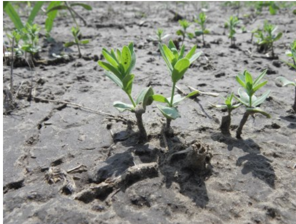
15 days following planting, 7/10/2013