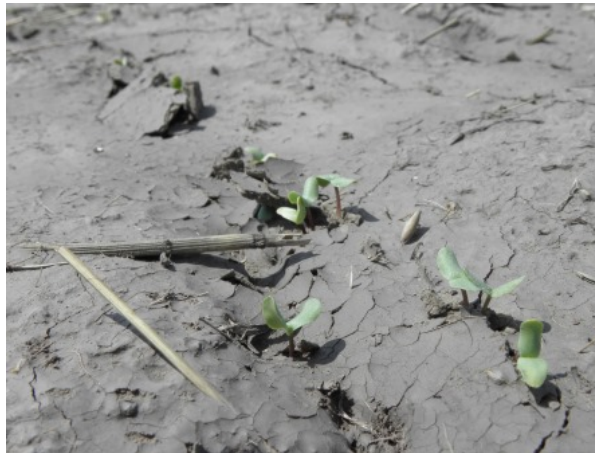
6 days following planting, 7/1/2013