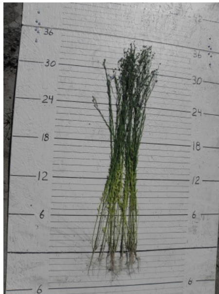
62 days following planting, 8/26/2013