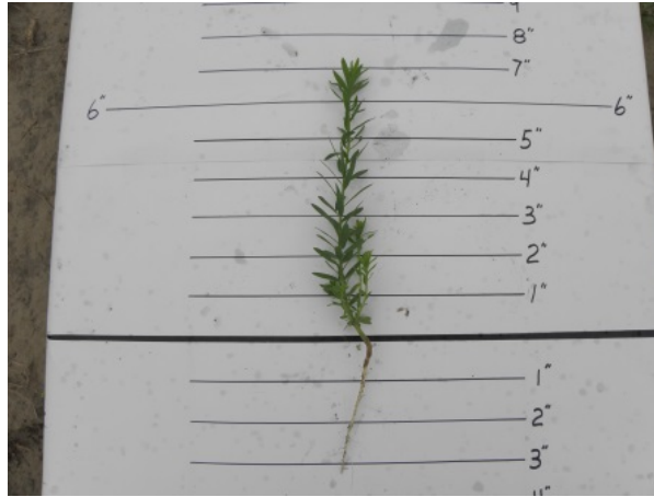
30 days following planting, 7/25/2013