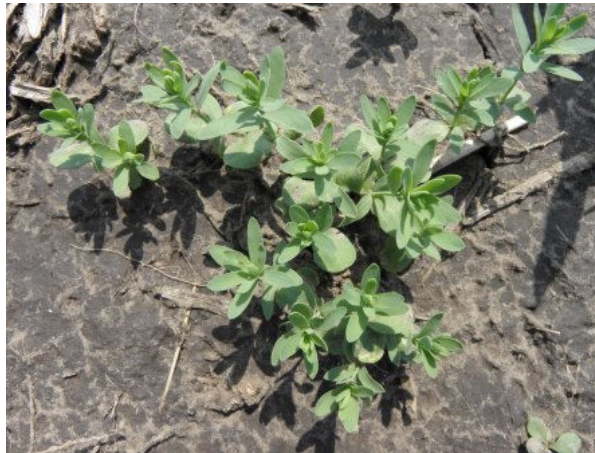
15 days following planting, 7/10/2013