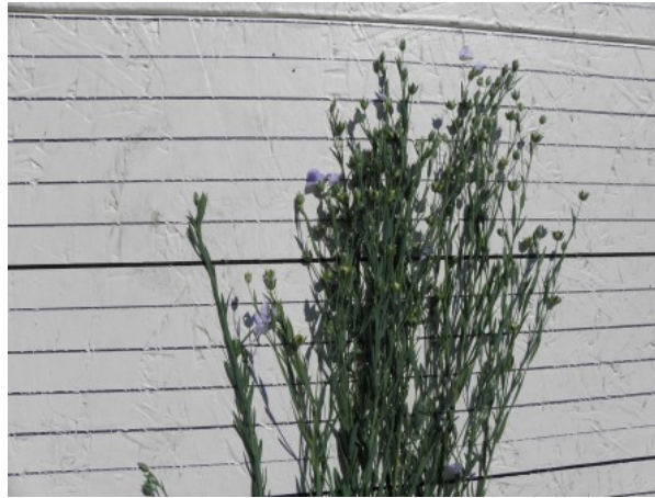
62 days following planting, 8/26/2013

NRCS Home | USDA.gov | Site Map | Civil Rights | FOIA | Plain Writing | Accessibility Statement Policy and Links | Non-Discrimination Statement | Information Quality | USA.gov | Whitehouse.gov