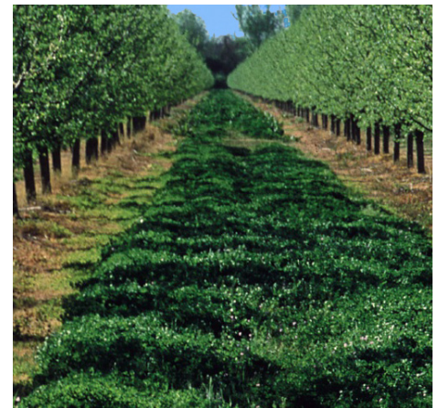
Cover crops in an orchard reduce soil erosion.