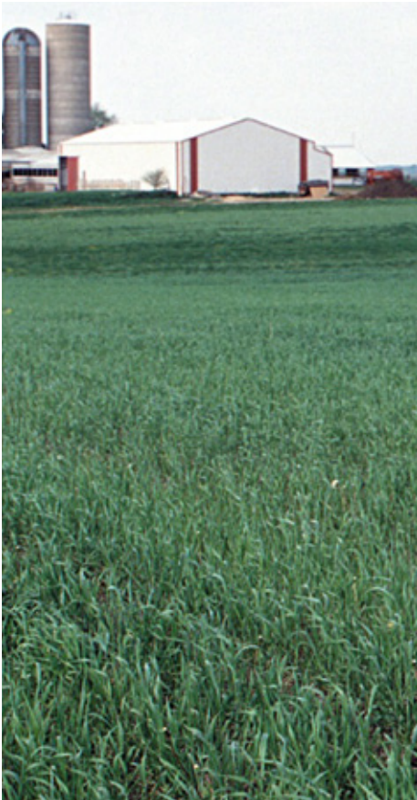
Cover crops on a field in Black Hawk County, Iowa.