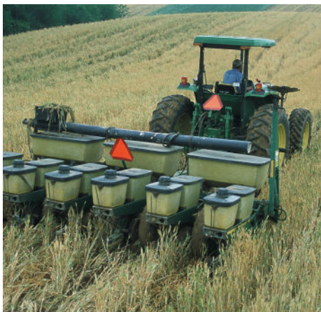
No-till planting of corn into cover crop of barley. Washington County, Virginia.

*See guidelines for details on the RMA summer fallow practice.