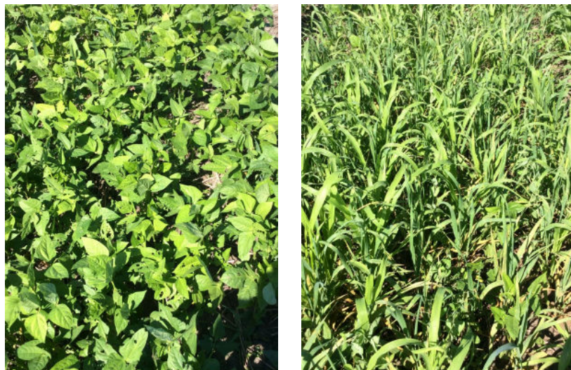
Figure 1. Legumes vary in the amount of biomass and nitrogen they provide. Shown above are two legume-based cover crops: Cowpea (left) and a grass mix (right) with cowpea as one of its components.

Little information is available on the amount of N that is fixed when legumes are grown as cover crops. Much information has been generalized from forage and pasture studies of mixed stands of grasses and legumes. In mixed perennial grass-legume pastures, reported values for suitable legume stands of clovers and vetches often range from 50 to 100 pounds fixed N per acre for annual N fixation of legumes in mixed pastures.