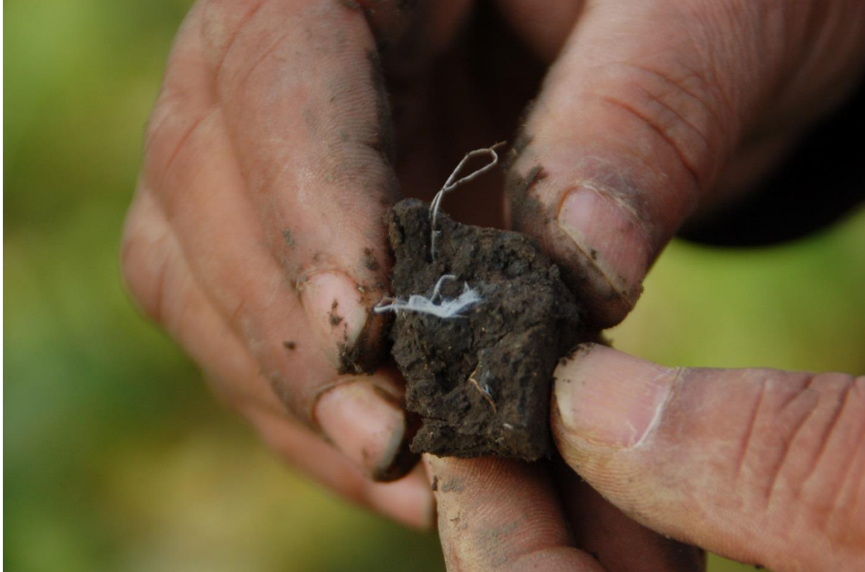
Figure 2: Mycorrhizal fungi are usually white or yellow while the root at the top is a light brown or tan color. Photo by Randall Reeder. Used with permission and All Rights Reserved.

complex molecules that the filaments then reabsorb. Fungi act like natural recycling bins, reabsorbing and redistributing soil nutrients back to plant roots. Most hyphae are either pure white or yellow and are often misidentified as plant hair roots (Islam, 2008). Figure 2 shows mycorrhizal fungi.