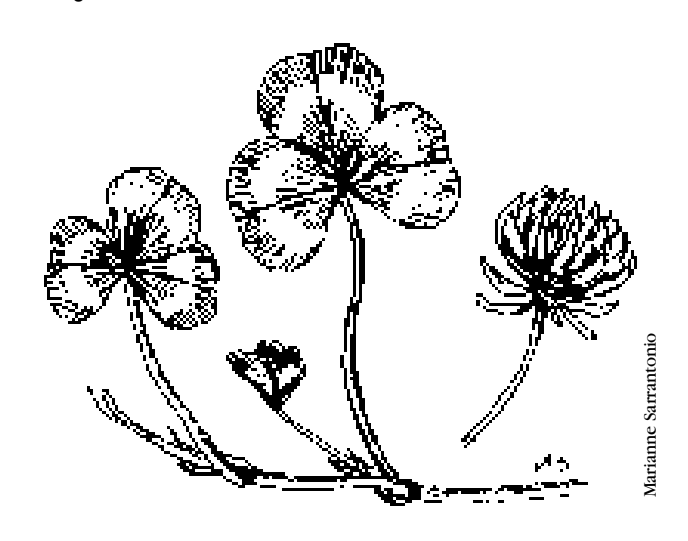
WHITE CLOVER ( Trifolium repens —intermediate type)

If not cut or grazed to stimulate new growth, the buildup of vegetation on aged stolons and stems creates a susceptibility to disease and insect problems. Protect against pest problems by selecting resistant cultivars, rotating crops, maintaining soil fertility and employing proper cutting schedules (361).