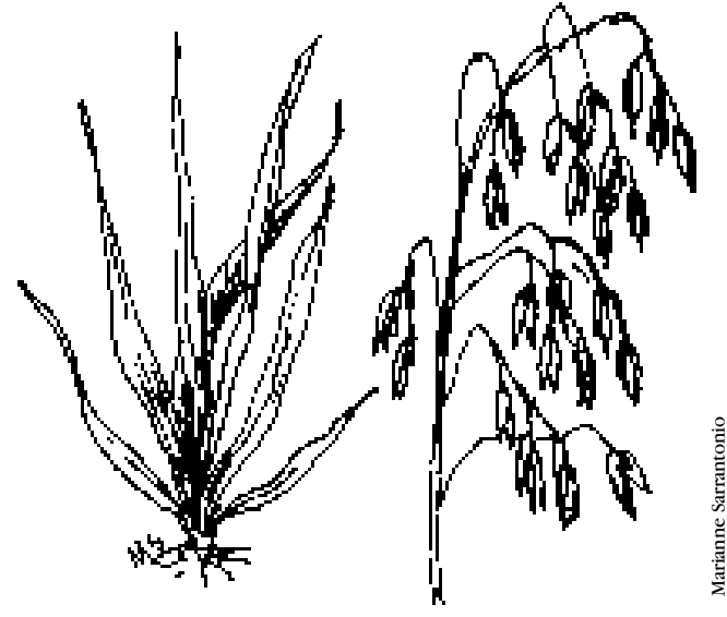
OATS (Avena sativa)

Easy to kill. Oats will winterkill in most of zone 7 or colder. Otherwise, kill by mowing or spraying soon after the vegetative stage, such as the milk or soft dough stage. In no-till systems, rolling/crimping will also work (best at dough stage or later). See Cover Crop Roller Design Holds Promise For No-Tillers , p. 146. If speed of spring soil-warming is not an issue, you can spray or mow the oats and leave on the soil surface for mulch.