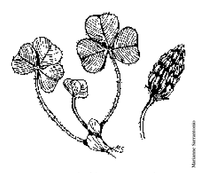
CRIMSON CLOVER (Trifolium incarnatum)

Beneficial habitat and nectar source. Crimson clover has showy, deep red blossoms 1/2 to 1 inch long. They produce abundant nectar, and are visited frequently by various types of bees. The blooms may contain many minute pirate bugs, an important beneficial insect that preys on many small pests, especially thrips (422). In Michigan, crimson increased blueberry pollination when planted in row middles. Georgia research shows that crimson clover sustains populations of pea aphids and blue alfalfa aphids. These species are not pests of pecans, but provide alternative food for beneficial predators such as lady beetles, which later attack pecan aphids.