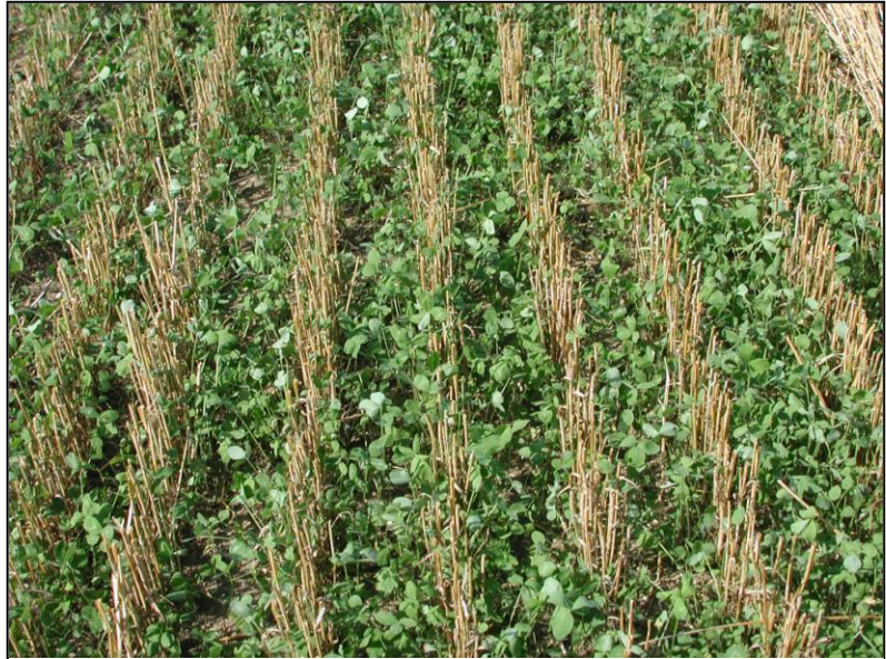
A red clover stand that was frost seeded into wheat.

Michigan's three common red clover cultivars are Michigan mammoth, Canadian mammoth (also known as Altaswede clover) and June (also known as medium red clover). Choose a cultivar based on how the seeding will be used. Canadian-grown mammoth clover does not tolerate the increased shading and competition from well fertilized wheat, but works well when seeded with oats. Michigan mammoth and June clover have been shown to perform better when frost seeded into well fertilized wheat fields.