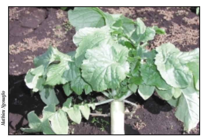
Fig. 1. Oilseed radish plant with large taproot.

Oilseed radish ( Raphanus sativus [L.] var. oleiferus Metzg [Stokes]), belongs in the Brassicaceae or Cruciferae plant family, commonly called the mustard family. This family includes many crops (cabbage, broccoli, cauliflower, Brussels sprouts, kale, radish and mustard), weed species (shepherd's-purse and