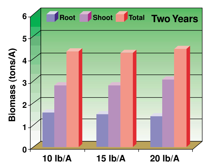
Fig. 6. Seeding rate.

Plants in the Cruciferae family produce glucosinolates. These are secondary metabolites that have shown activity on insects, fungi and other pests. Studies in Michigan are looking at the effects of oilseed radish on diseases and pests. Certain cultivars such as Adagio and Ultimo are reported to give better nematode suppression (especially cyst nematodes) than other cultivars. To suppress nematode populations, a high seeding rate is recommended. Higher populations provide a larger number of small and fine roots. More roots mean more root exudates that stimulate egg hatching and more surface area for the nematodes to attach to in the absence of a suitable host. Oilseed radish should be used to enhance current management strategies, not as the sole control measure.