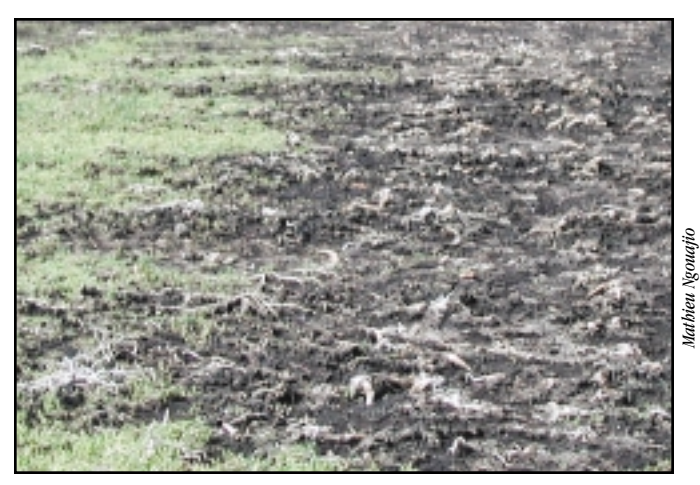
Fig. 5. Weed suppression by oilseed radish.