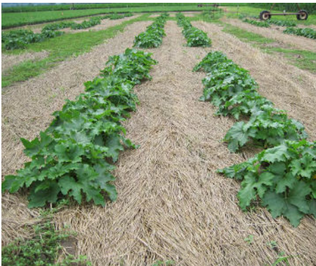
Figure 1. Pumpkin plants growing in a rolled rye strip-tillage system. The rye mulch is thick enough so that no soil is visible, allowing it to suppress weeds.