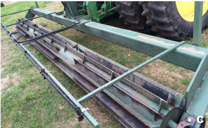
Figure 5. (A) Chevron-patterned, rear-mounted; (B) Front-mounted cover-crop roller (I & J Manufacturing, LLC, Gap, Pa.); (C) Custom-built roller crimper with herbicide boom attachment (built by Austin Hamilton, Southern Valley Fruit and Vegetable, Inc., Norman Park, Ga.)