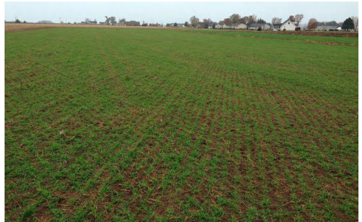
Figure 2. Winter cereal rye in early November, one month after being drilled at 100 lbs/acre.

In order to encourage adequate growth before killing, cover crop mixes containing peas should be seeded early in the fall season. Legume crops can be successfully grown with a cereal crop to reduce the nitrogen delay that can occur with 100% grain stands while still providing thick, long lasting mulch.