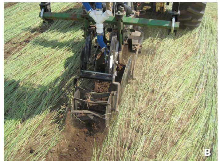
Figure 6. Strip till assembly (6000 Strip-Till; Hiniker Company, Mankato, Minn.). (A) Left to right: 18" coulters with 16" gauge wheels, adjustable shank (5"-9" depth) with 18" berming discs, and a rolling basket. (B) Backside view of strip tiller.