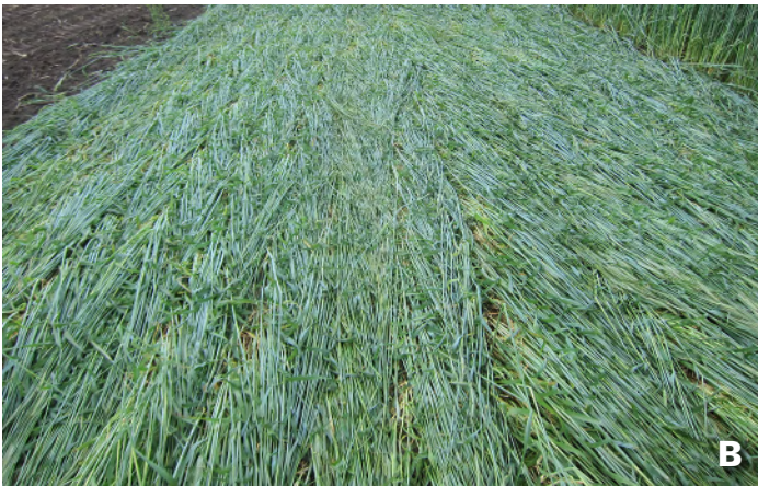
Figure 3. Cereal rye residue after the pass of the roller crimper. (A) Poorly planned, as soil is visible through the mulch. Late seeding, at a lower rate and rolling in the same direction in which the seed was drilled; seeding rate was 50 lbs./acre. (B) Ideal choice, as no soil is visible. This can be obtained by seeding earlier at a higher rate, or rolling perpendicular to the direction of seeding; seeding rate used was 100 lbs./acre.