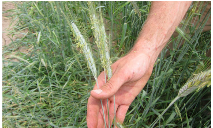
Figure 4. Cereal rye at anthesis stage. Pollen is shedding when plant is in full bloom.

The tool best-suited for the job is a roller crimper. The goal of a roller crimper is to knock over a mature